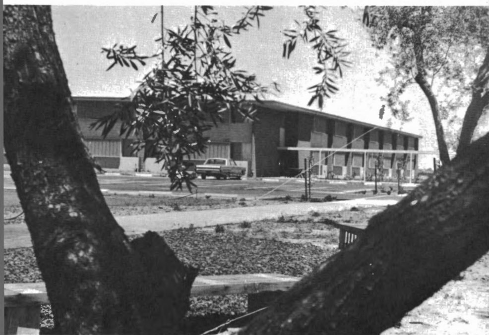
Student residence hall located in the vicinity of the College. (See page 45.)